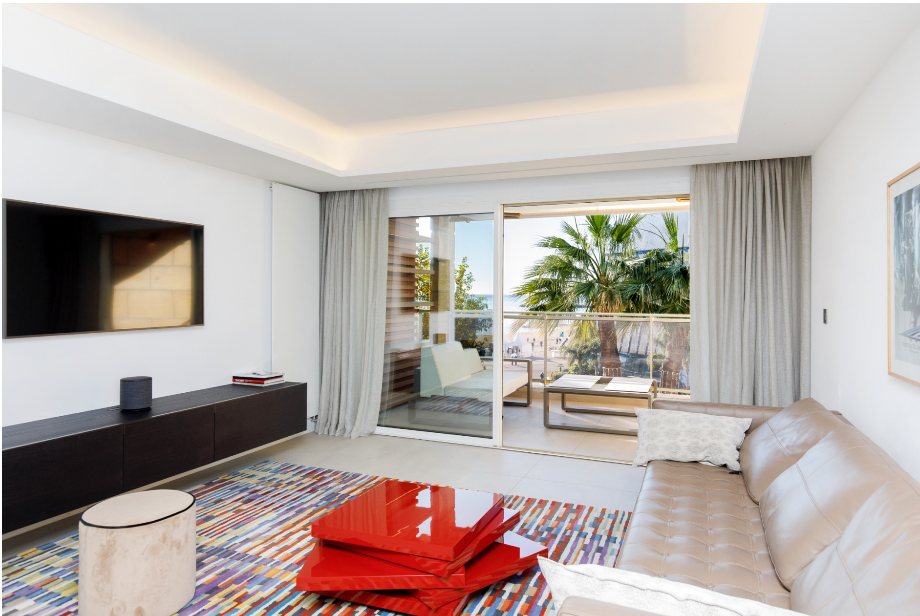
The living room, perfect for meetings