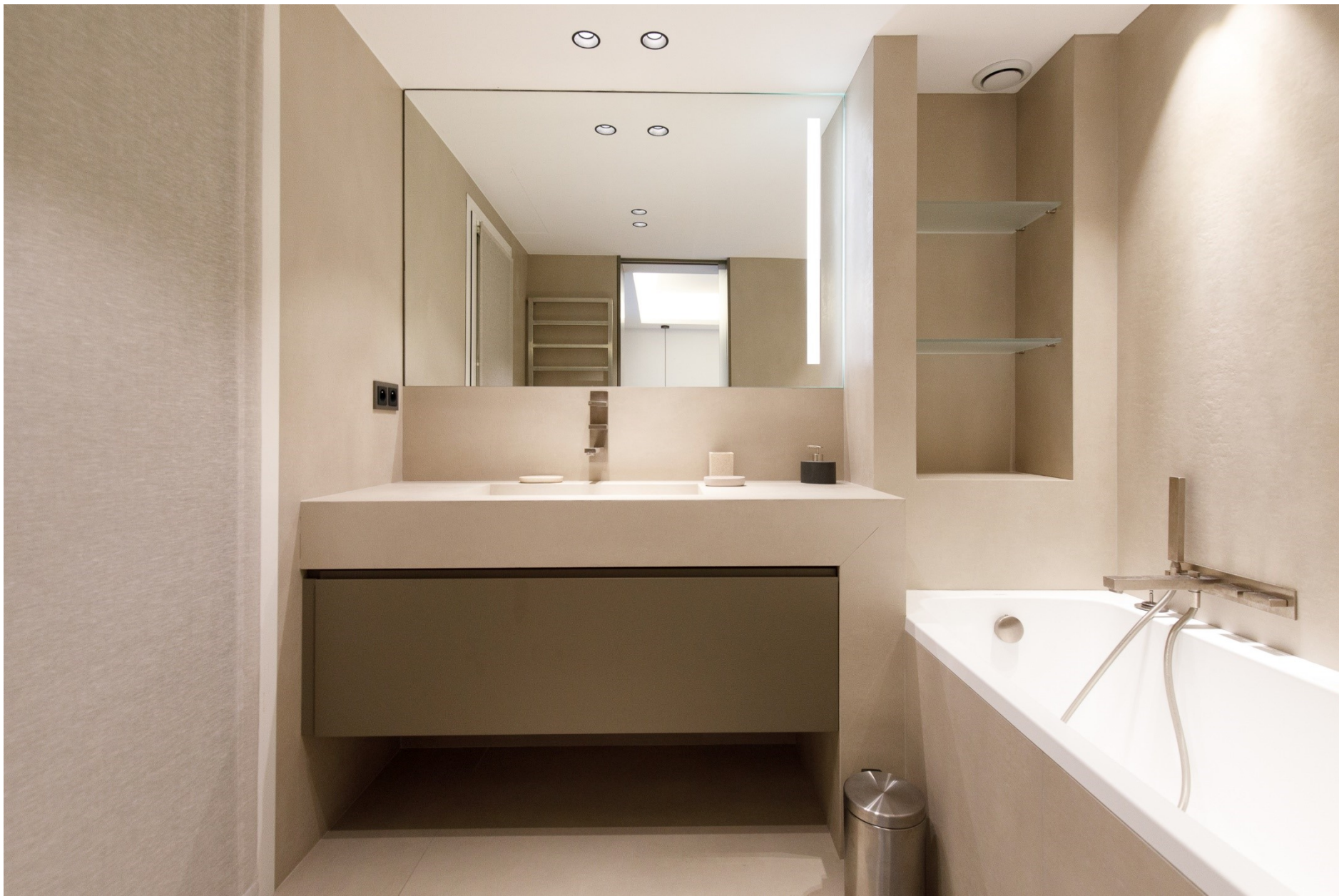
Ensuite bathroom with bathtub for the 2 nd bedroom