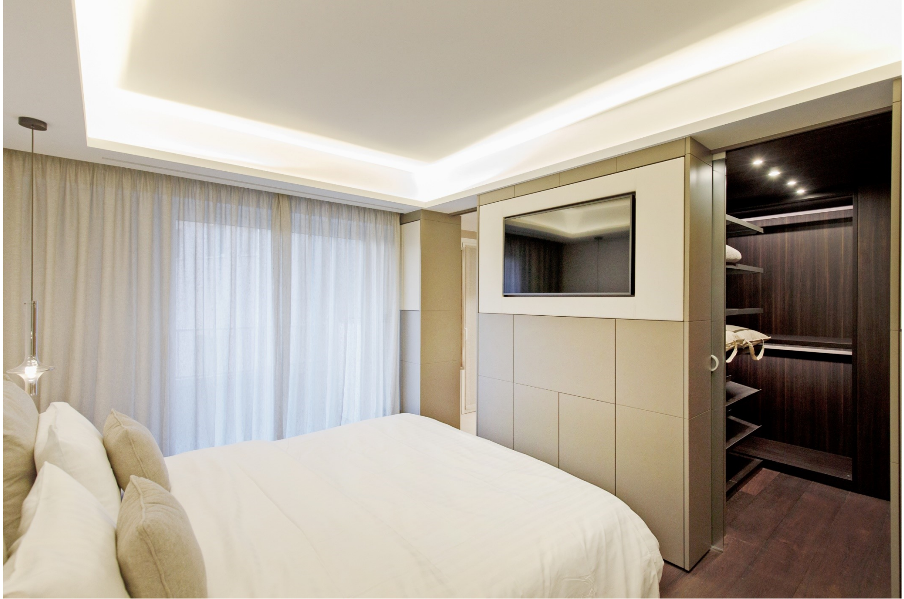
The second bedroom with a double bed, large dressing