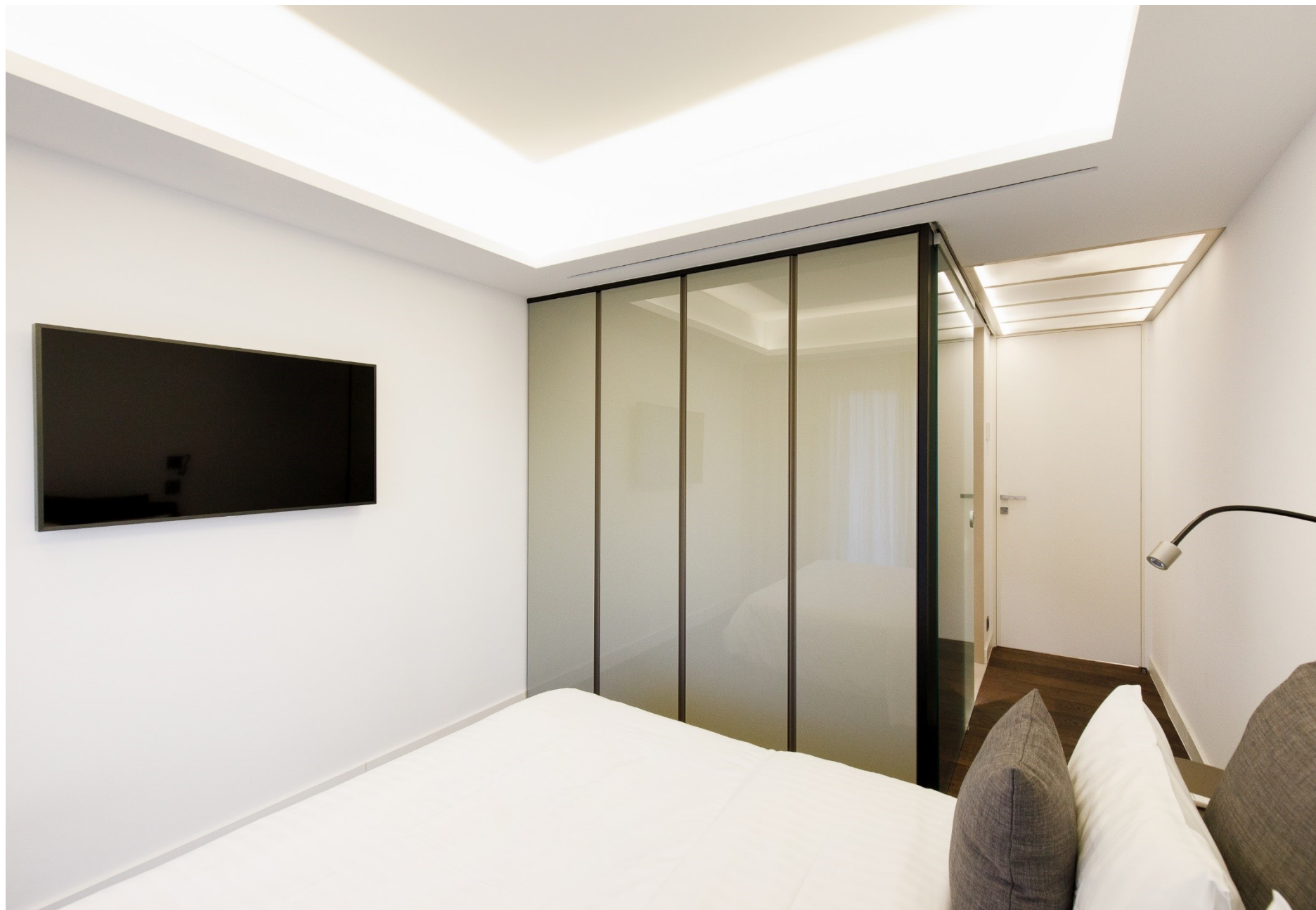
Another view of the 1st bedroom with TV