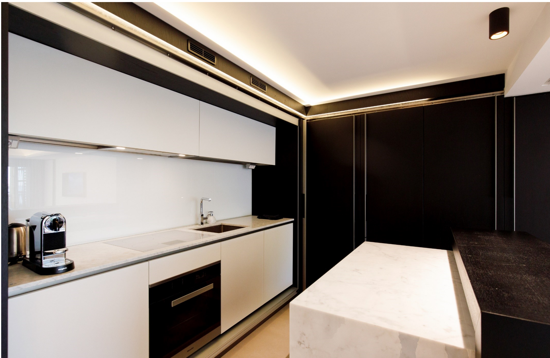
Fully equipped kitchen when opened