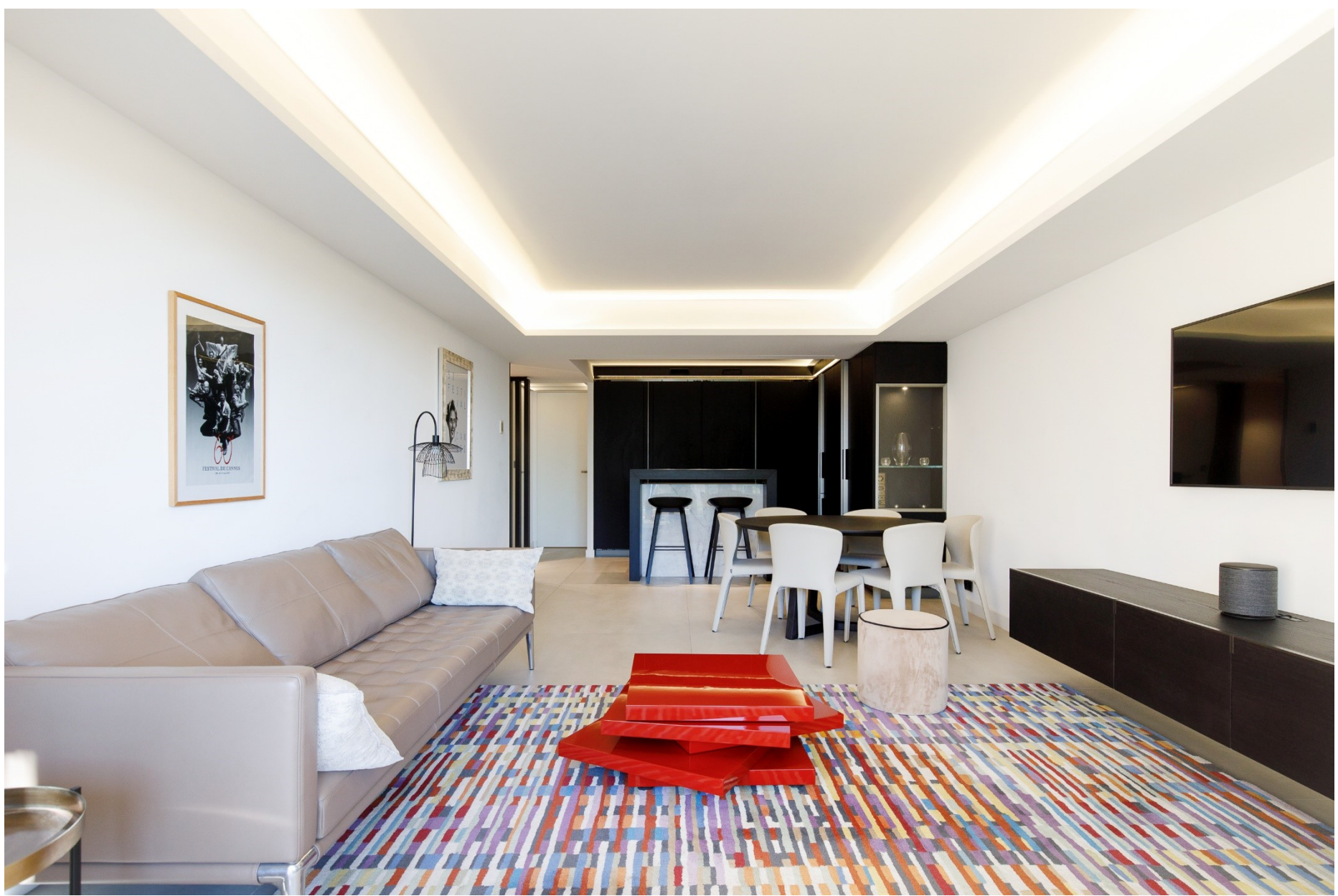
Living room overview with kitchen closed for events