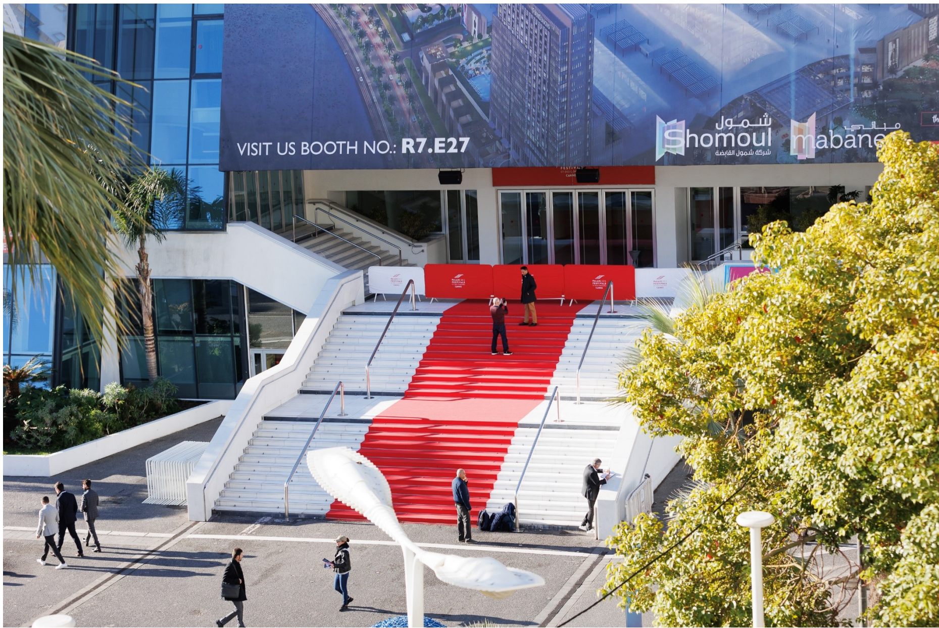
The view over the Red Carpet