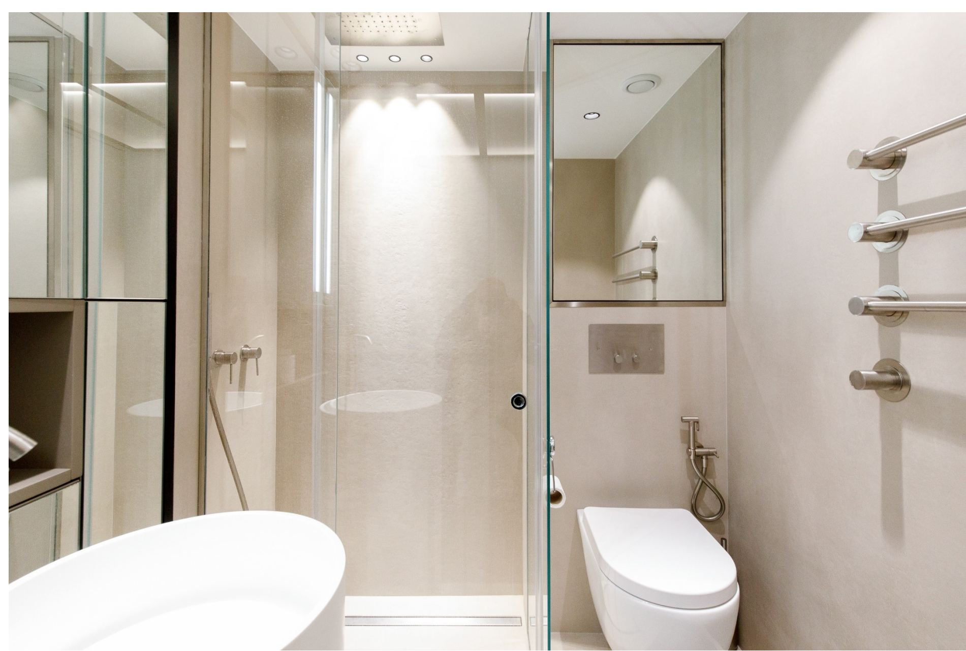
Ensuite shower room with toilet from the 1st bedroom