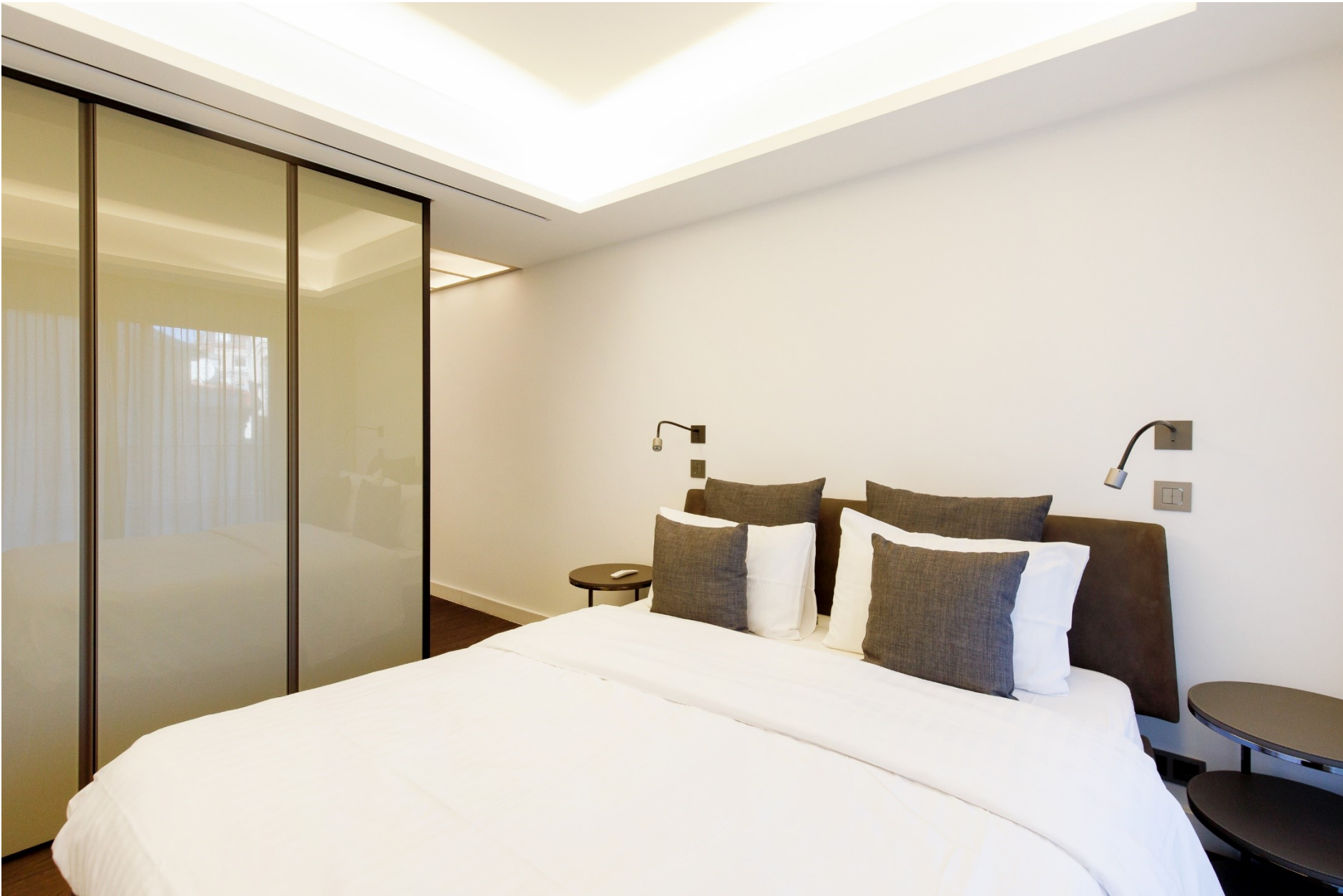
The first bedroom with a double bed, cupboards