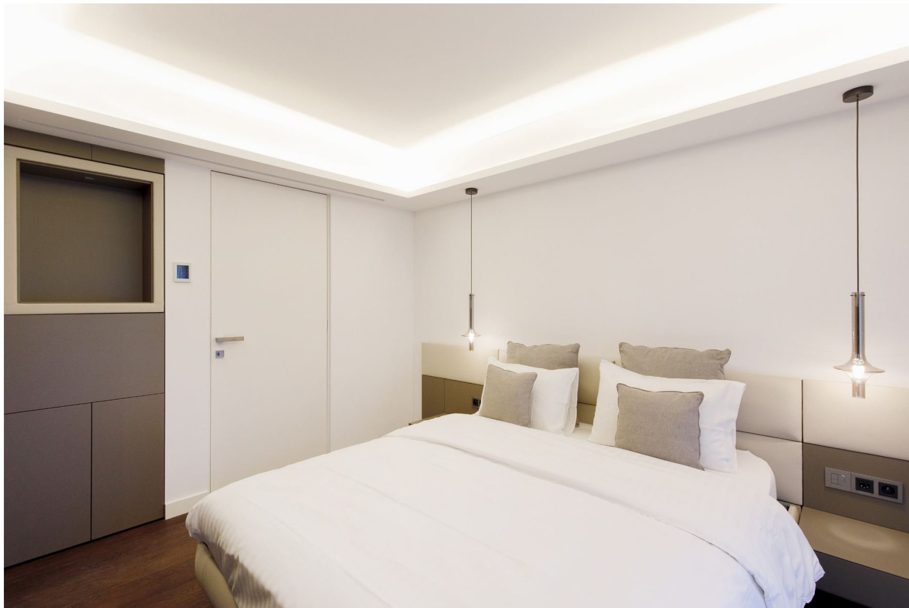
Another view from the 2 nd bedroom