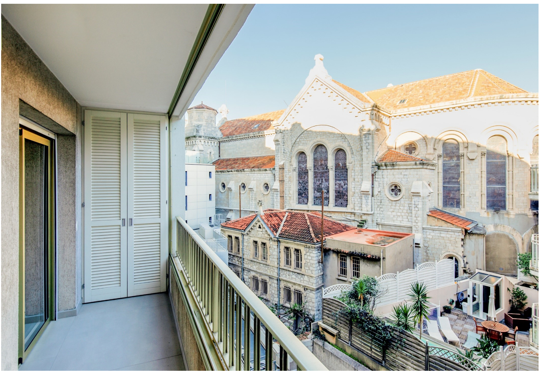
The back terrace, view on the church